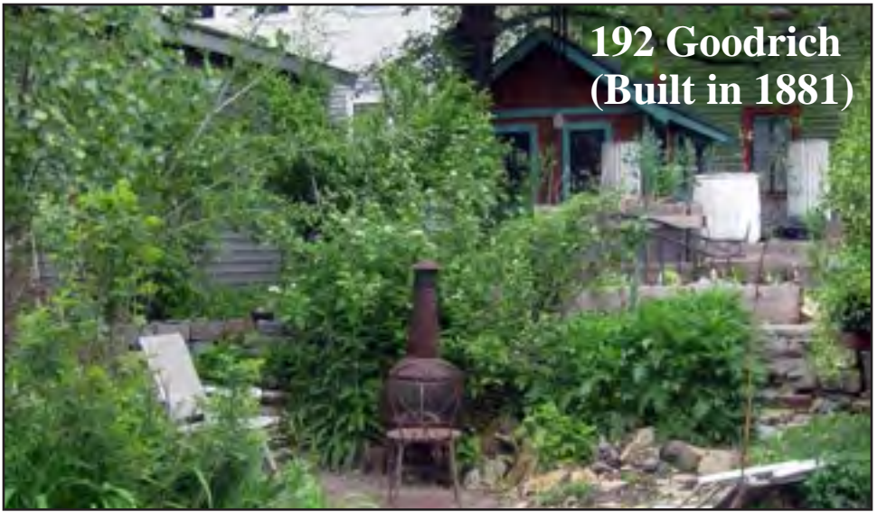
192 Goodrich (Built in 1881)

This garden is a grand example of ‘Making Do’! When this gardener found herself in a home with no garden or yard she brought in some soil and began planting in the piles of dirt. A creative container garden uses whatever materials are at hand: stones, old boards, and plenty of Ramsey County Compost. This garden will almost make admirers forget it is built on a cement slab!