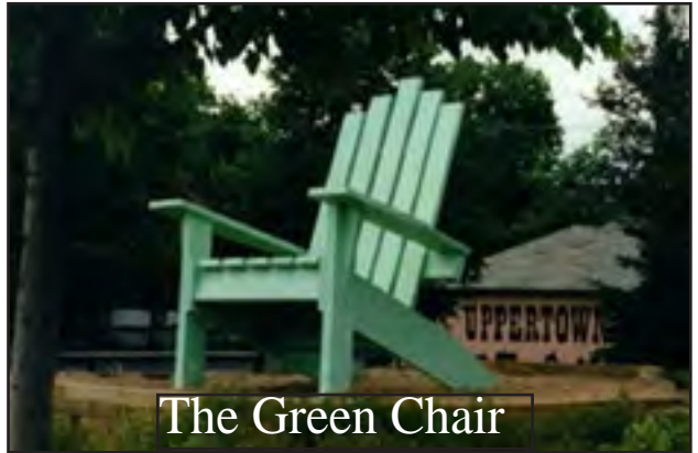
The Green Chair

front yards to bring neighbors together and watch over their streets.