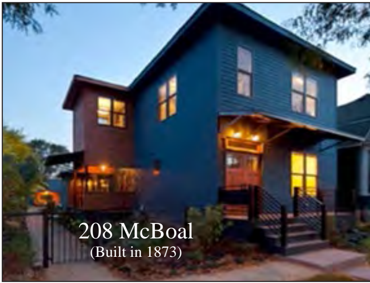
208 McBoal (Built in 1873)

This is a reclaimed abandoned home and its grounds were renovated in 2010-11. After the entire yard was graded with new soil, shade and ornamental trees, shrubs and