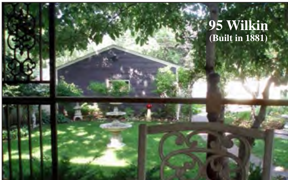
95 Wilkin (Built in 1881)

The garden view from the gazebo looks onto a peaceful oasis with bee & butterfly-friendly perennials and colorful annuals. The fountain is calming and a source of water for many birds.