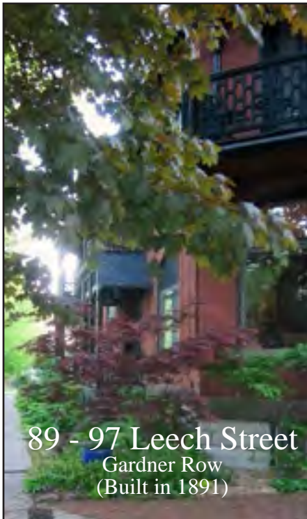
89 - 97 Leech Street Gardner Row (Built in 1891)

perennials were planted along a crushed rock path. An arbor and deck with planters and fire pit added inviting elements that passersby enjoy. Local artist Mary Esch will be painting flowers plein air in this backyard.